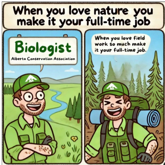
Photo 2. Intermediate Biologist – Peace River, Facebook post.