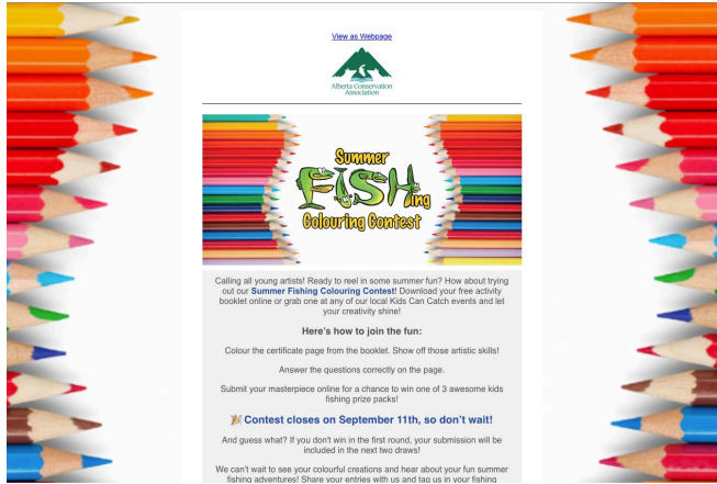
Photo 3. Summer Fishing Colouring Contest promotional newsletter.