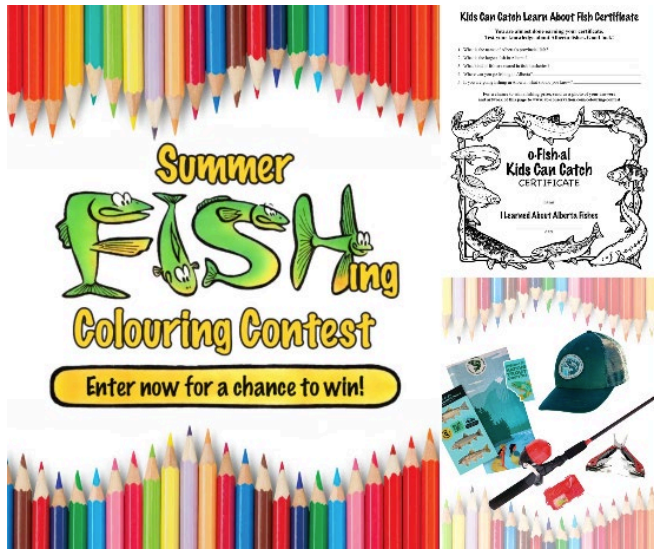
Photo 1. Summer Fishing Colouring Contest promotion, Facebook post.